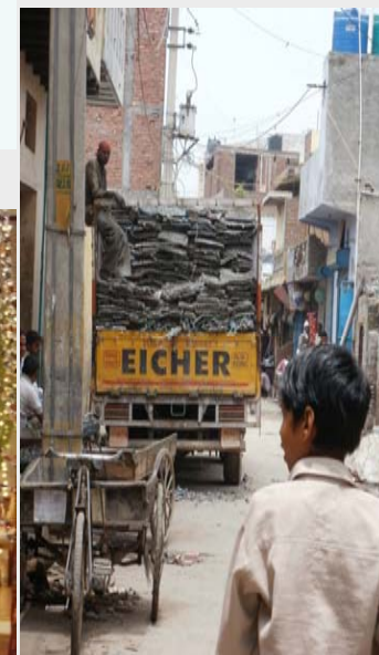
Informal Economy an integral part of South Asian culture